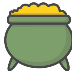
POT OF GOLD