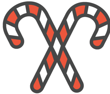
2 CANDY CANES