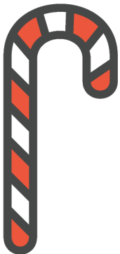
1 CANDY CANE